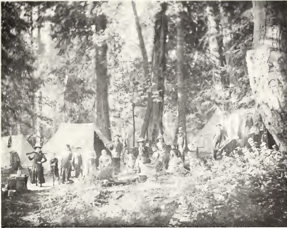
Figure 10. Family group of campers near Huckleberry Mountain, circa 1910. Note the berry-bucket held by one of the younger girls.

Some of these sites continue to be used while others have been abandoned. They represent an early form of Forest recreation use, a factor which has become increasingly important to the region's economy. The presently-used sites have been modified to varying degrees by modern features, but are protected from timber-harvest projects by being placed in the Unregulated class. As cultural resources, the currently-used sites may be susceptible to damage through future development. The old campsites at Huckleberry City should be protected from development. Care should be taken that recreational improvements do not destroy the historical-aesthetic quality of such places as Union Creek and Dead Indian Soda Springs.